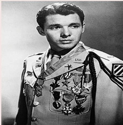
Audie Murphy photographed in 1948 wearing the U.S. Army khaki "Class A" (tropical service) uniform with full-size medals.

Birth name - Audie Leon Murphy Born - 20 June 1925 Kingston, Texas, U.S. Died - 28 May 1971 (aged 45) Brush Mountain, near Catawba, Craig County, Virginia, U.S. Buried - Arlington National Cemetery Allegiance - United States of America Service/branch - •United States Army •United States Army National Guard •United States Army Reserve Years of service - •1942–45 (U.S. Army) •1950–66 (Texas Army National Guard) •1966–69 (U.S. Army Reserves) Rank - •First Lieutenant (U.S.) •Major (Texas Army National Guard) Awards - •Medal of Honor •Distinguished Service Cross •Silver Star Medal (2) •Legion of Merit •Bronze Star (2, 1 "V" device) •Purple Heart (3) •Army Good Conduct Medal •Distinguished Unit Citation (2) •American Campaign Medal •European-African-Middle Eastern Campaign Medal (9 campaigns, arrowhead device) •World War II Victory Medal •Army of Occupation Medal with Germany clasp •French Legion of Honour (grade of Chevalier) •French Croix de Guerre with silver star •French Croix de Guerre with palm (3) •Belgian Croix de Guerre with palm •French fourragère in colors of the Croix de Guerre •Combat Infantryman Badge •Marksman Badge with Rifle Component Bar •Expert Badge with Bayonet Component Bar •Outstanding Civilian Service Medal •Texas Legislative Medal of Honor Other work - Actor, songwriter, rancher